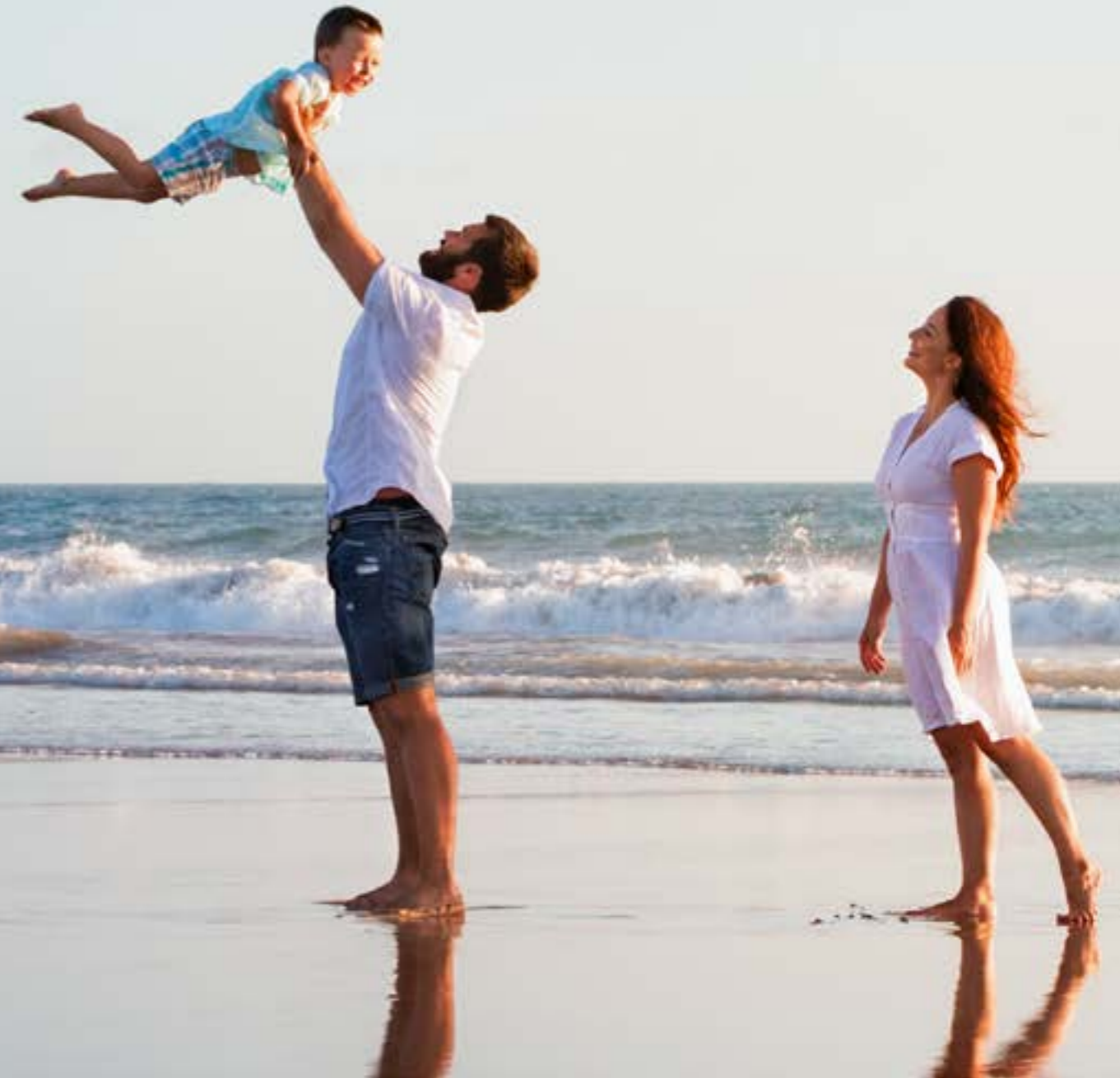
St Leonards Beach

Whether you're searching for a peaceful weekend retreat or a place to call home, Seaside Estate offers the ultimate coastal escape, close to luxurious Wineries, serene beaches, and lively neighbouring towns.