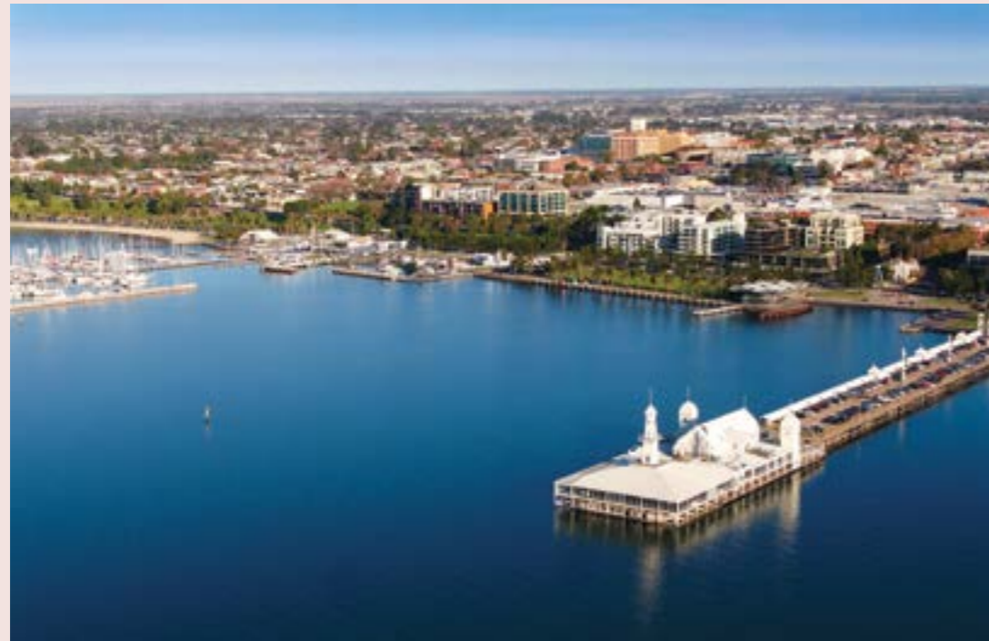
• Geelong Waterfront