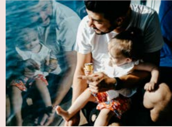
• Geelong CBD