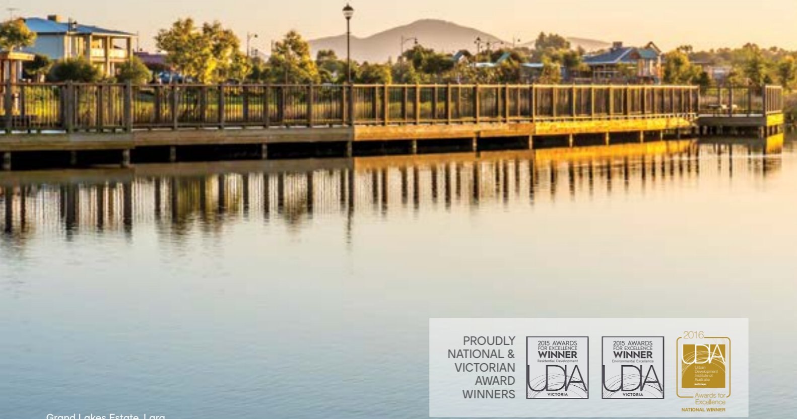
Grand Lakes Estate, Lara

“Live the dream at Seaside Estate – where lifestyle, community and investment potential come together in perfect harmony.”