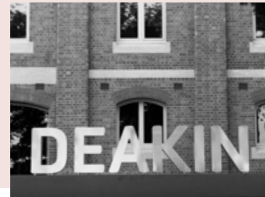
• Deakin Waterfront