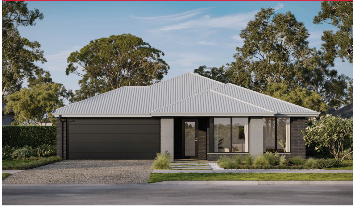
BERRIMA 28 | ELEVATE RANGE