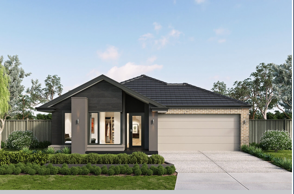
Price excludes: Fencing Landscaping Concrete payers Planter boxes Deckir