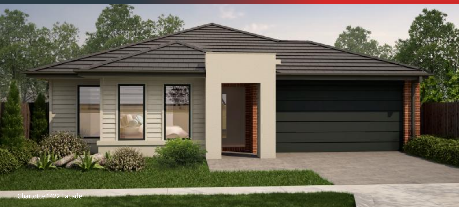
Charlotte 1422 Facade

LOT 208 PATHFIELD STREET , WATTLE GROVE , CORIO