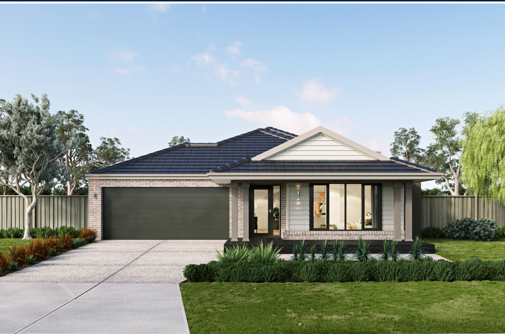
Price excludes: Fencing, Landscaping, Concrete pavers, Planter boxes, Decking