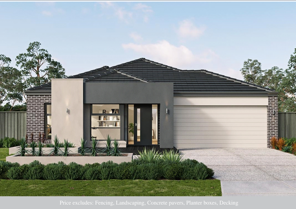
Price excludes: Fencing, Landscaping, Concrete pavers, Planter boxes, Decking