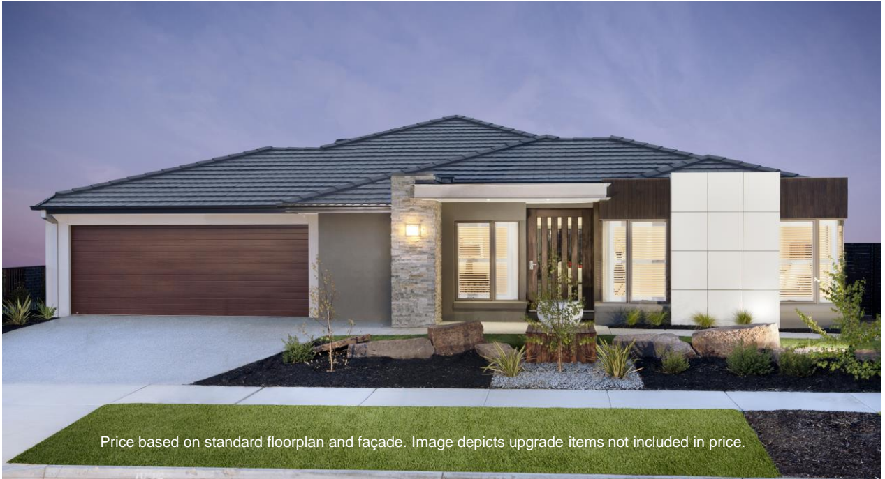
Price based on standard floorplan and façade. Image depicts upgrade items not included in price.