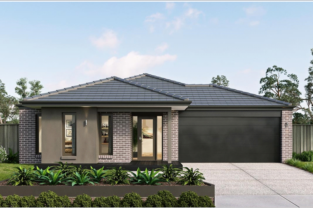
Price excludes: Fencing, Landscaping, Concrete pavers, Planter boxes, Decking